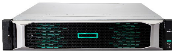
HPE Primera 600 (2-Node Storage Base)

For the latest information on supported operating systems refer to Single Point of Connectivity Knowledge for HPE Storage Products (SPOCK): http://www.hpe.com/storage/spock .