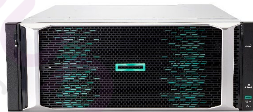
HPE Primera 600 (4-Node Storage Base)